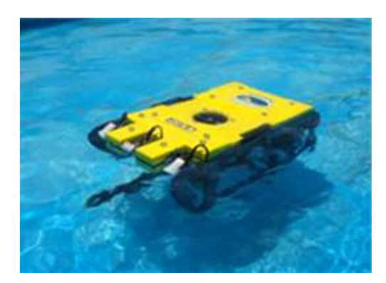
KAXAN equipment for underwater inspection developed by CIDESI

✓ Development of criteria for evaluating the condition of the bridges included in the system SIPUMEX contemplating the state of its foundations with respect to the mining, which will substantially improve the process currently in use for risk assessment of bridges and the prioritization of interventions performed.