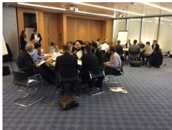
Figure 3 London workshop (March 16 th , 2016)