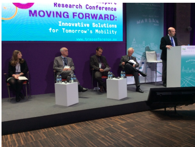
Figure 7 Speakers at Green and resilient infrastructure

During the same day, a strategic session on “Green and resilient infrastructure” was organised at TRA2016 where Dragados, member of REFINET, was one of the speakers together with Acciona, Colas, University of Dublin, Voestalpine and Polish State Railways. This session had been promoted by ECTP through the Infrastructure and Mobility Committee with the participation of CSTB and Dragados.