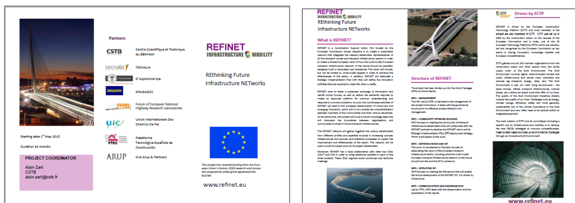
Figure 9 REFINET leaflet