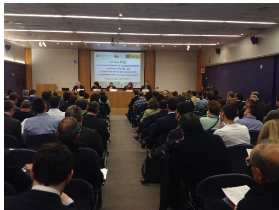
Figure 11 Presentation of REFINET at 11 th PTEC's Conference

ENCORD: under the coordination of DRAGADOS, REFINET has been presented and discussed in all ENCORD meetings of the first year of the CSA. ENCORD will continue the activities of providing input to REFINET during the second year of the project. REFINET has been a topic in the following ENCORD meetings: