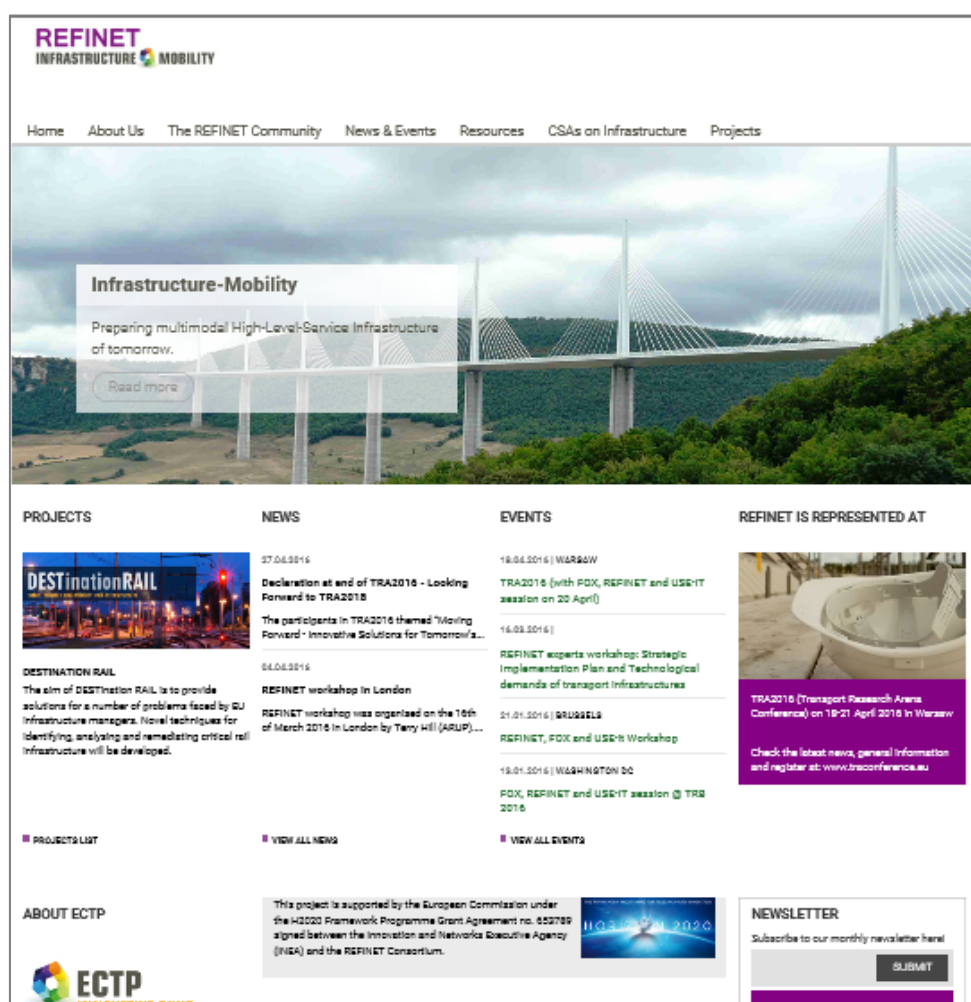
Figure 1 REFINET website

More detailed information about the REFINET website has been included in Deliverable 5.1