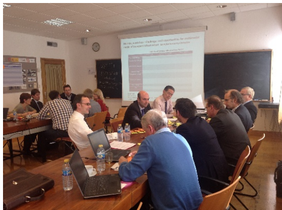
Figure 2 Madrid workshop (Dec. 2 nd , 2015)